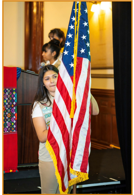
Presentation of Colors