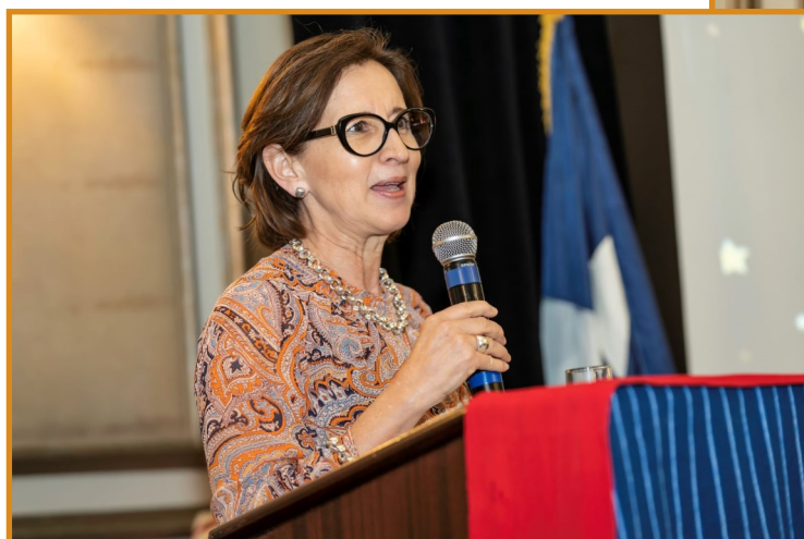
To Our Legacy—Our Future