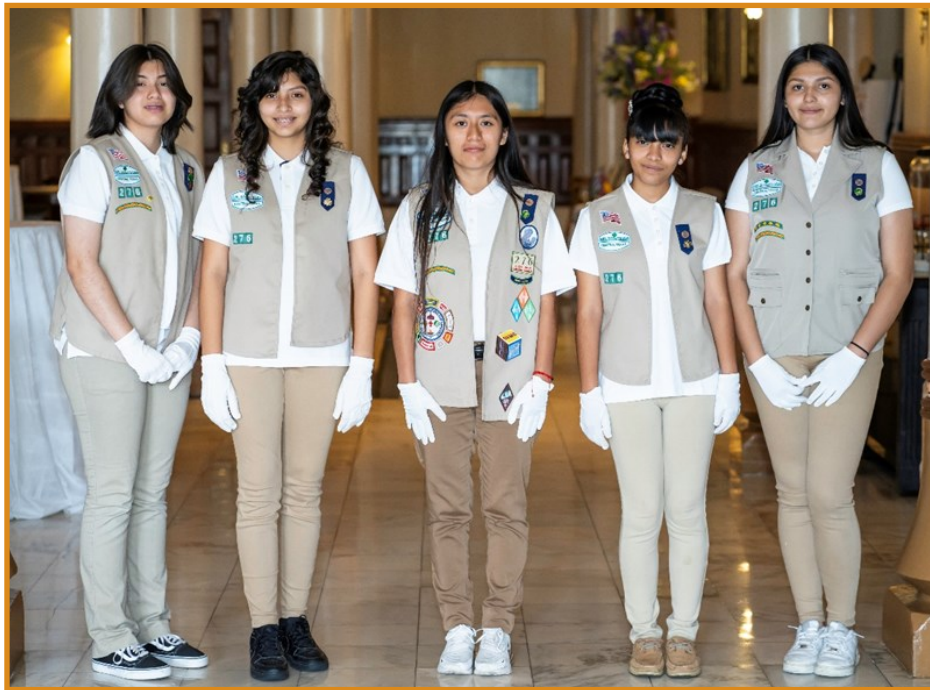
Girl Scout Troop # 276 from Austin presented the colors at the event.