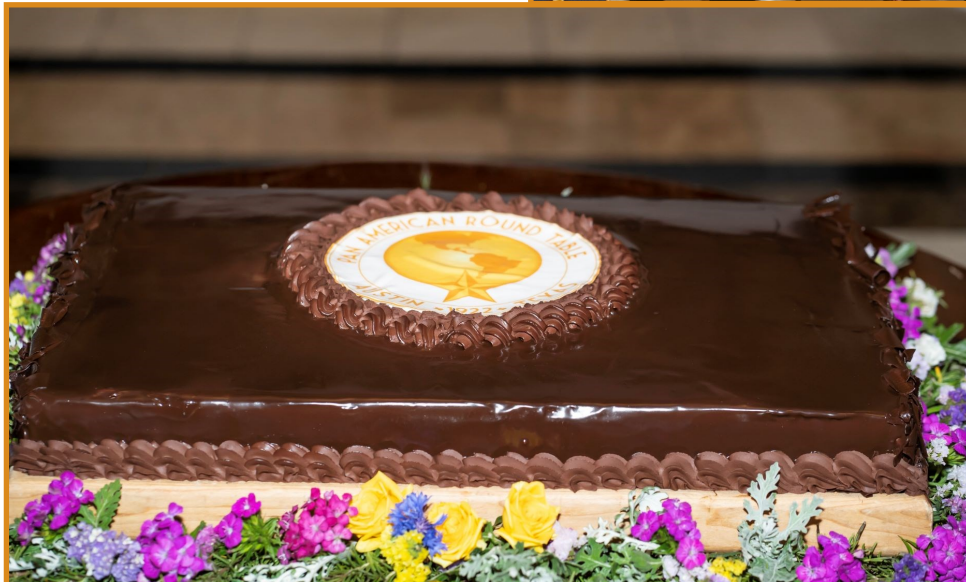
The delicious Driskill's Signature 1886 Chocolate Cake with the PART of Austin logo in gold